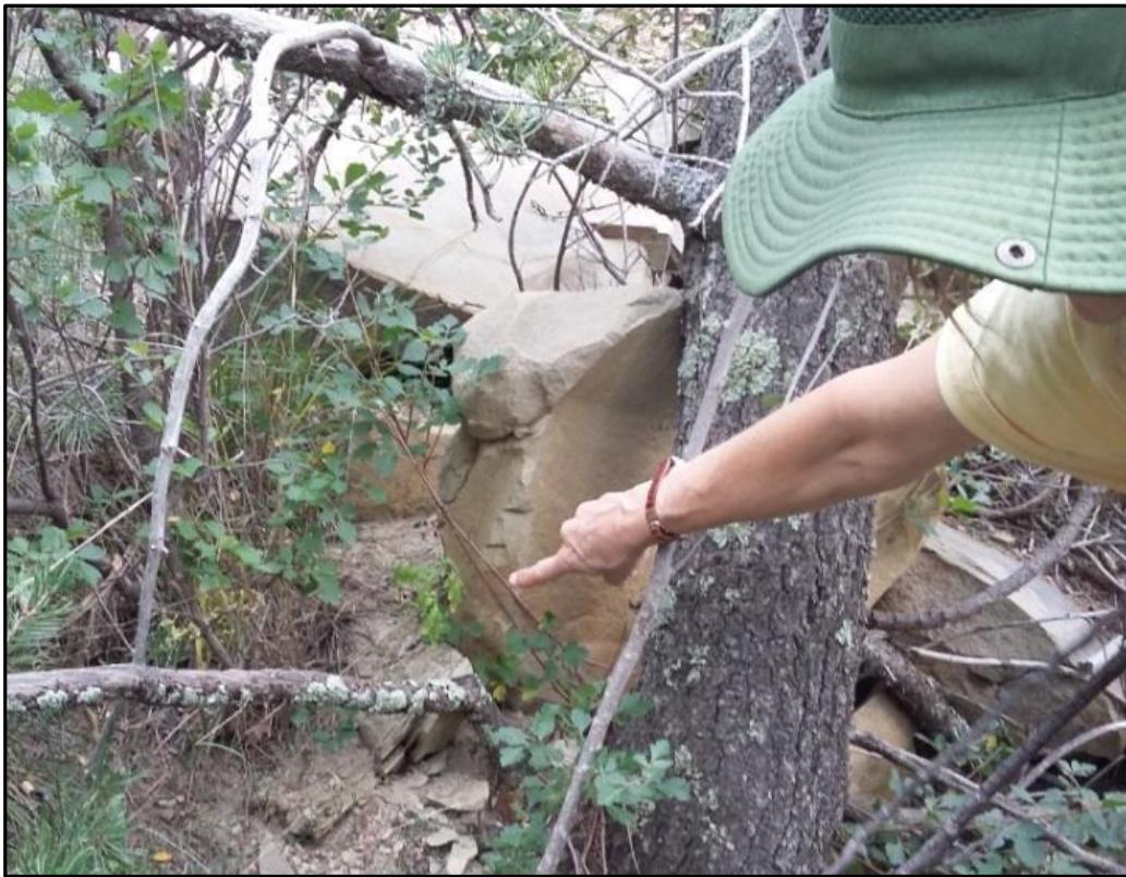
Wild potato ( Solanum jamesii Torr.) in New Mexico.