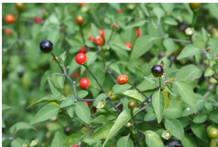
Chiltepin ( Capsicum annum var. glabriusculum (Dunal) Heiser & Pickersgill).

While many people might assume that wild crop relatives hold little food value, the native and immigrant foragers of Arizona and surroundings would argue otherwise. Nutritionally and culturally important harvests in the desert Southwest may have begun as early as 10,900–10,100 calendar years B.P. (Louderback and Pavlik 2017) and continue to this day for wild potatoes ( Solanum L. spp.) onions ( Allium L. spp.), the wild chile peppers ( Capsicum annum var. glabriusculum (Dunal) Heiser & Pickersgill) known as “chiltepin,” and for many other wild berries, fruits, greens, and culinary herbs. In Arizona alone, native species belonging to at least 24 of the genera listed in Table 1 have been documented as collected and used by the state’s culturally diverse residents. Many of these foods are gathered from vacant lots, along roadsides, and in other urban or disturbed habitats, while others require long treks into wild places. Native traditional knowledge and permits for collecting in protected natural areas enable sustainable management of harvests.