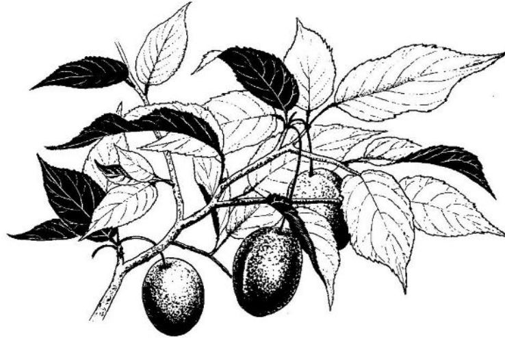
Wild plum ( Prunus L. sp. ). Drawing by Paul Mirocha.